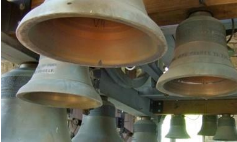
June 2017 Chimes

The first chapter in William Barclay's book The Mind of Jesus is titled "The Great Discovery." In it he writes, it may be said that there are two great beginnings in the life of every man who has left his mark upon history. There is the day when he is born into the world; and there is the day when he discovers why he was born into the world. All of us struggle at times to discern what our purpose in life really is. Having a sense of purpose is what gives life meaning and allows us to become all that God has created us to be. Making that great discovery doesn't just happen -- it requires effort on our part, and often a great deal of effort! In The Purpose Driven Life , Rick Warren reminds us that the true reason we are here is far greater than our own personal fulfillment, peace of mind, or happiness. If you want to know why you were placed on this planet, he writes, you must begin with God.